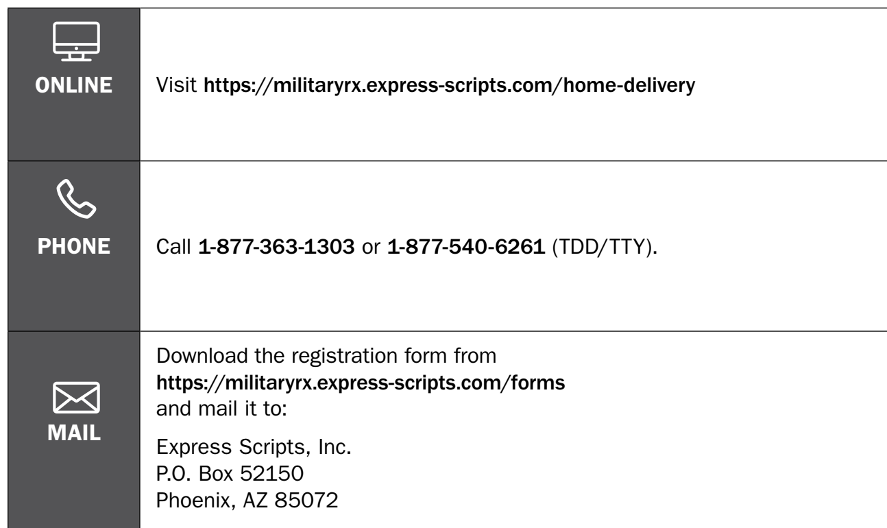
Figure 4.1 TRICARE Pharmacy Home Delivery Registration Methods

When visiting non-network pharmacies, you pay the full price of your medication upfront and file a claim to get money back. Claims are subject to deductibles, out-of-network cost-shares, and TRICARE-required copayments. All deductibles must be met before you can get money back. For details about filing a claim, see the Claims section of this handbook.